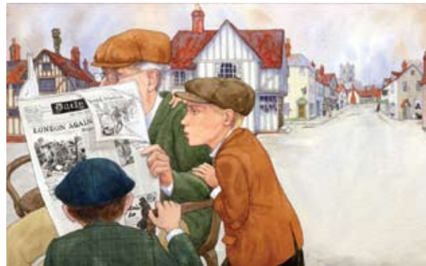
Welcome to America, Champ!

Easel with large sheets of paper Screen or blank wall Microphone (for large groups)