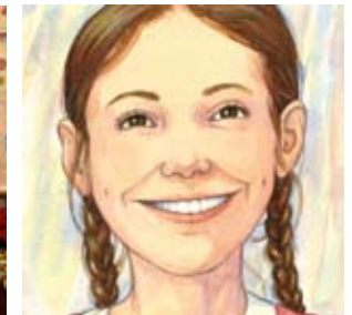
The Orange Shoes