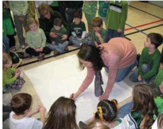
Tree Murals with Pre-K and Kindergarteners Brass Castle School, Washington NJ

After an early career as an editorial illustrator, she has spent the last 20 years illustrating for children.