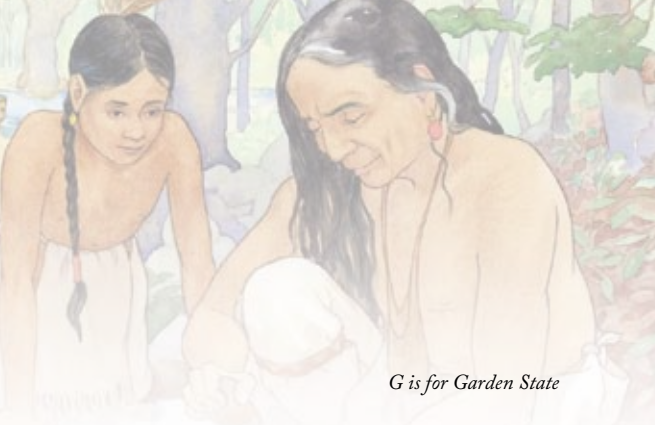
G is for Garden State