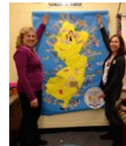
Mural - Tinc Rd. School

A book sale gives each student the chance to buy a signed book at a discounted price. You may make arrangements with your local bookstore or order directly from the publishers.